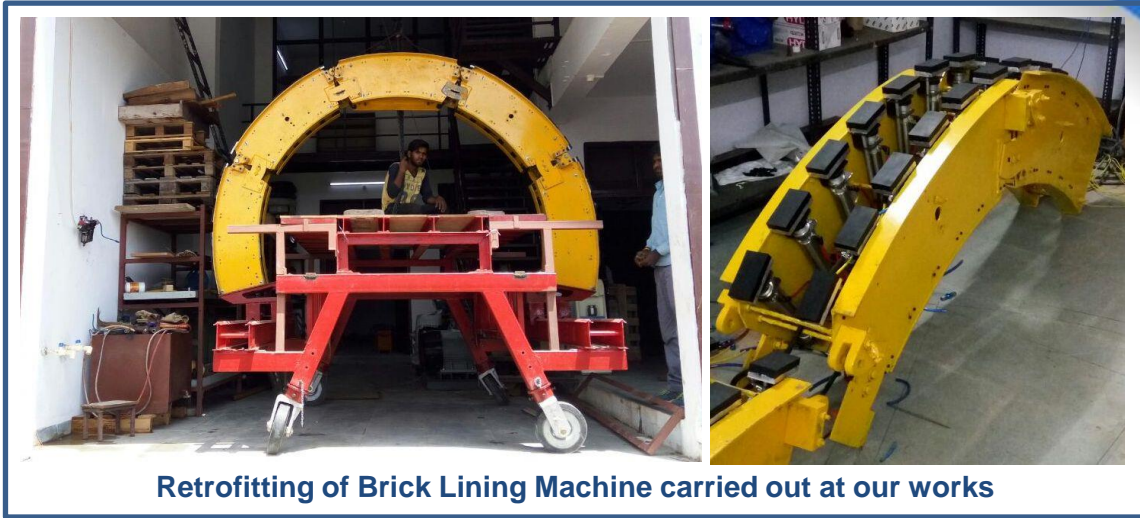
Retrofitting of Brick Lining Machine carried out at our works